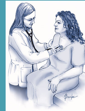
360° Assessment Process